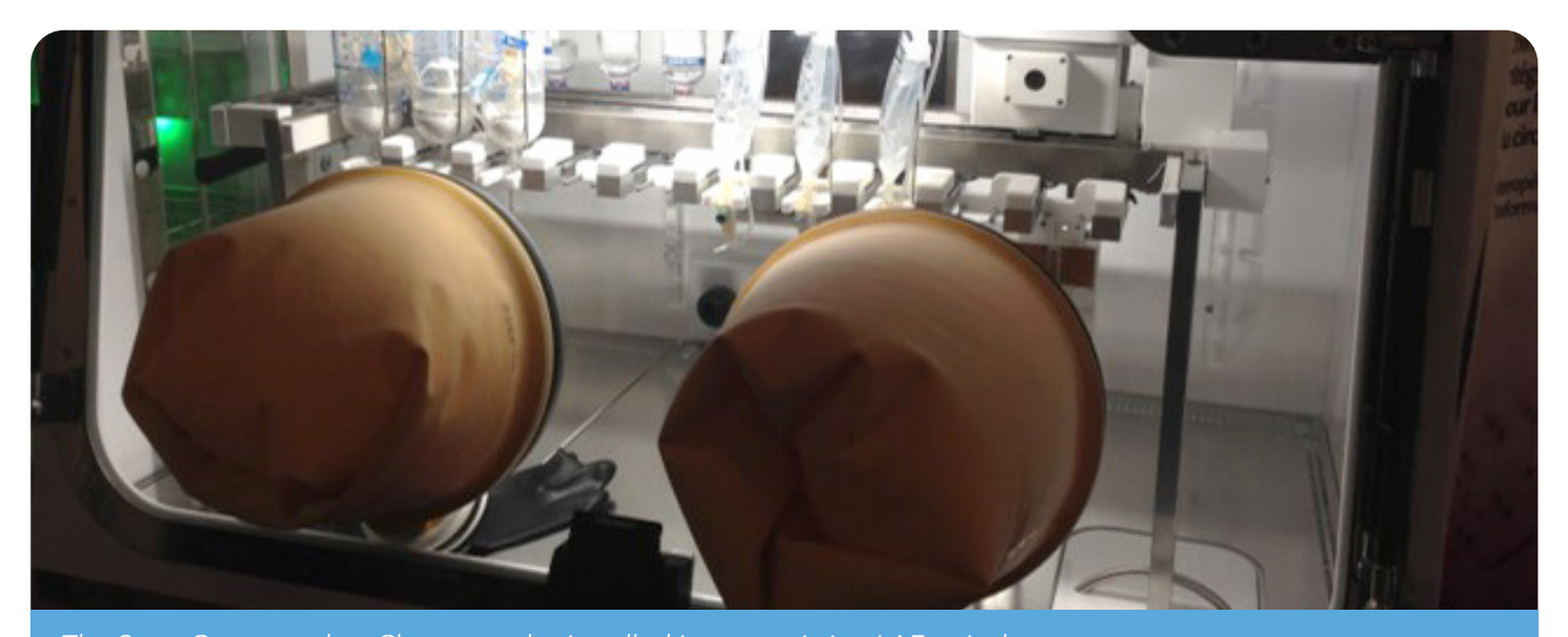
The SmartCompounders Chemo can be installed in your existing LAF or isolator